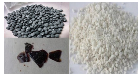
Fentanyl in pill, black tar, and powder form

If exposed, Call 911; In case of overdose, Call 911 and administer Narcan (naloxone)