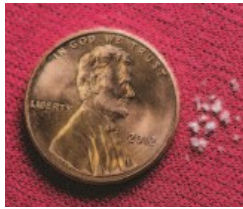
Two milligrams of powder fentanyl, a potentially lethal dose

Fentanyl is a Schedule II synthetic opioid approved for use as a painkiller and anesthetic. The drug's extremely strong opioid properties—both analgesic and euphoric—have made it an attractive drug of abuse for opioid users. It is the most potent opioid available for use in medical treatment – 50 to 100 times more potent than morphine and 50 times stronger than heroin. Its euphoric effects are indistinguishable from morphine or heroin.