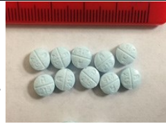
Counterfeit 30 milligram Oxycodone pills containing fentanyl

Illicitly-produced fentanyl is increasingly available in the form of counterfeit prescription pills. Fentanyl traffickers use fentanyl powder and pill presses to produce pills that resemble popular prescription drugs, such as oxycodone, hydrocodone, and Xanax®. The pills are sold in illicit U.S. drug markets, and users typically do not realize the pills are laced with fentanyl. The amount of fentanyl intended for each tablet is very small, and operators risk creating hot spots, or areas of higher concentrations of fentanyl in the pills. DEA's analysis of 8 kilograms of fentanyl tablets indicated the average illicit fentanyl-laced tablet contained 1.1 milligrams of fentanyl, with a range of 0.03 to 1.9 milligram per tablet. Such a large amount of fentanyl in each pill is alarming considering that approximately 2 milligrams is a lethal dose for most non-opioid-dependent individuals.