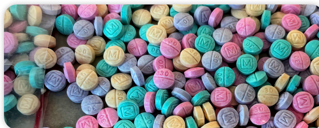
*FAKE rainbow oxycodone M30 tablets containing fentanyl